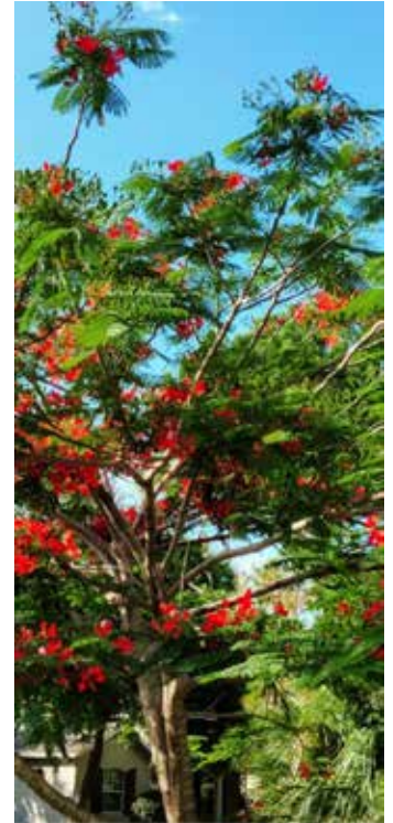
Royal Poinciana tree