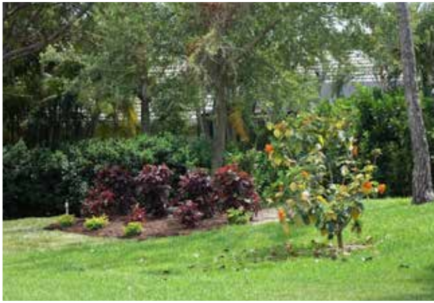
Clear Creek Park with its new Copperleaf and Duranta Gold plantings and the sod installed. Now, all we need are the summer rains to complete the look.