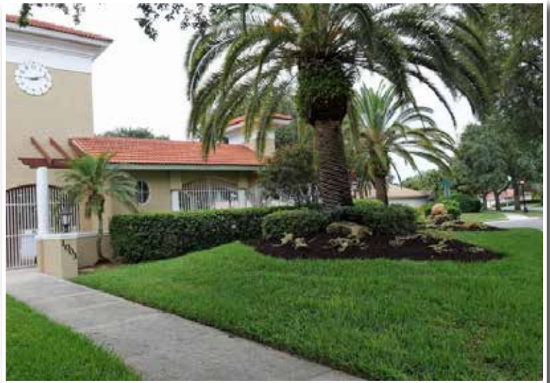
In front of the pool the plants around the boulder and the adjacent pineapple palm received dark mulch which "finished" the look and served to heighten the color of the plants.

It's always an unknown what might happen when you take a moment to have a seat and observe.