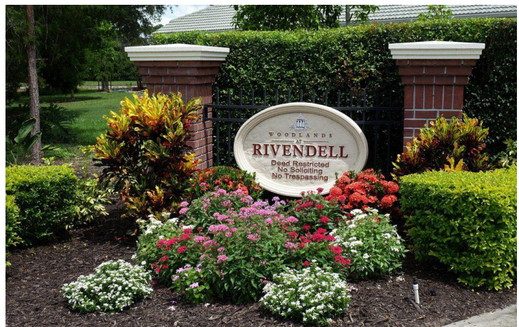
Rivendell’s recently updated north entrance.

Keeping true to its origin and heritage, the Rivendell Board, along with our dedicated committees, volunteers, and many residents, are working together to keep our community’s natural assets healthy and vibrant to attract wildlife, build community spirit, and keep property values strong. You can help too: volunteer in the community, fertilize and irrigate responsibly, don’t litter, keep preserve areas untouched, and celebrate the beauty of living in Rivendell every day.