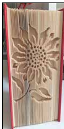
Cut and Fold Method