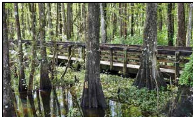
Boardwalk through the Cypress

If you ever wanted to walk on the wild and wet side with little fear that an alligator will devour you, you might want to check out the organized Wet Walks held at Ft. Myers Slough Preserve. When we visited the park, the Wet Walk was not being held. According to the park's schedule the next ones are to be Sept. 29, Oct. 13, and Oct. 20. Participants are advised to wear long pants on the walk, and tie-up shoes are mandatory. You'll be walking in fresh clean rainwater up to your waist. When you finish the walk, you won't be muddy, but you will be wet, so bring along a change of clothes.