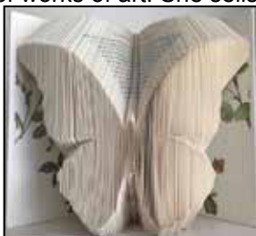
Mark and Fold Technique

To get started, Kay goes to used-book stores and selects books that are in good condition. Then she sets to work. There are several types of folding patterns available. One is