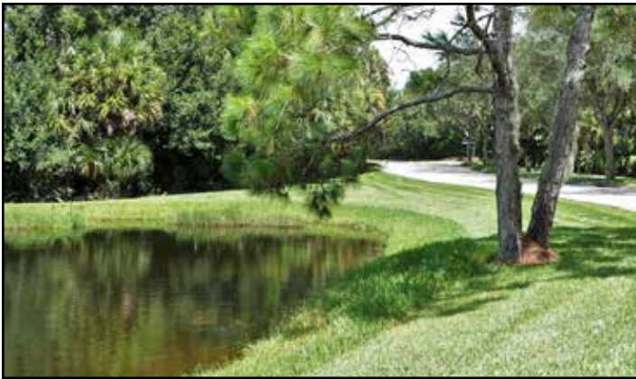
Egret Pond erosion-control shoreline ~ photo by Nancy Dobias 9-2-2018