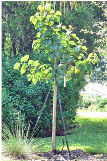
Orange Geiger in Butterfly Park

The photos are a small sample of the new foliage along with a tentative list of what else might be planted where. If you aren't sure what the trees and bushes look like, just Google the name!