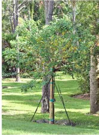
Hong Kong Orchid in Crescent Park