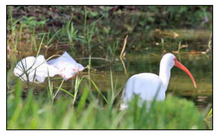
This poor Ibis is eating its lunch on Egret Pond while litter floats nearby.

Do you know where litter goes? Is it somewhere no one knows? Thinking that means you've been conned! Litter ends up in your pond!