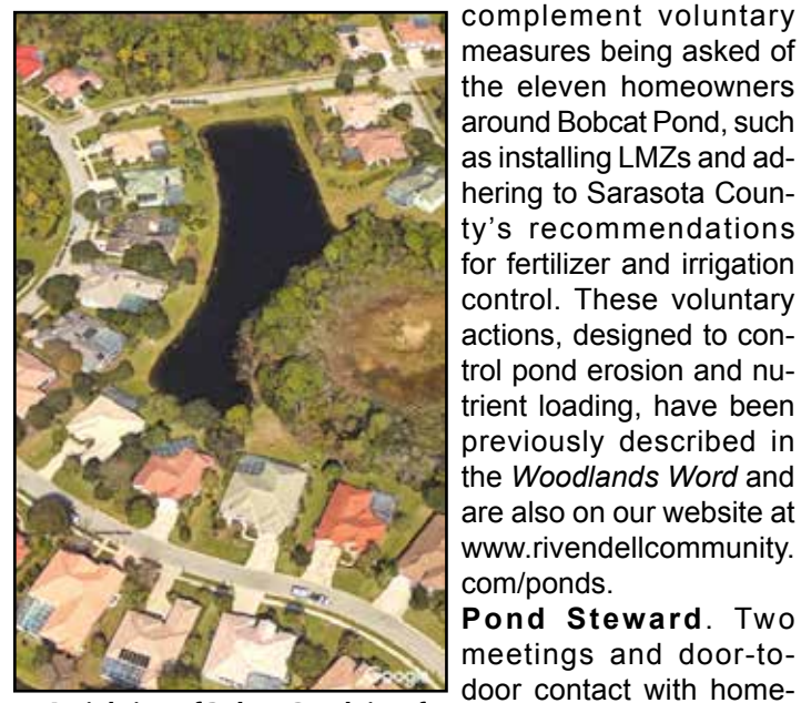
Aerial view of Bobcat Pond site of pilot project #2

Voluntary Homeowner Actions. The actions by our Board