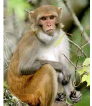
A rhesus macaque monkey - Silver Springs State Park, photo by John Raoux/AP