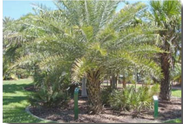
Indian Wild Date Palm

901 North Shore Drive NE, St. Petersburg or call 727-893-7335