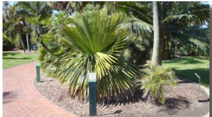
Cuban Petticoat Palm