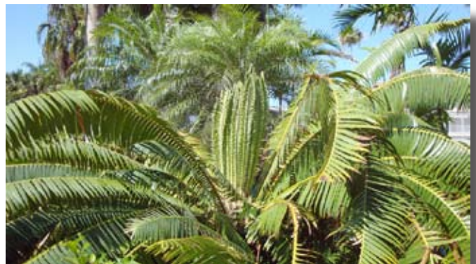
Queen Sago Palm