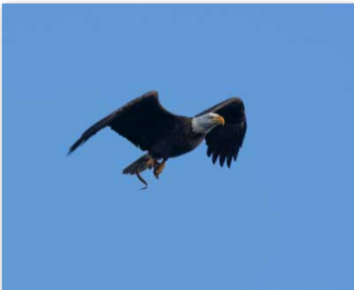
This Bald Eagle soars overhead with an eel in its talons.