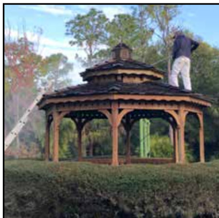
Bath day for the Gazebo