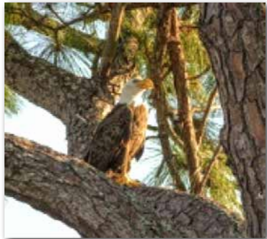
Bald Eagle surveys Rivendell from its perch in a pine tree.

FUN FACT: Largely because of its role as a symbol of the United States, but also because of its being a large predator, the bald eagle has many representations in popular culture. However, not all of these are accurate. In particular, the movie or television bald eagle typically has a bold, powerful cry. It actually has a much softer, chirpy voice, not in keeping with its popular image; so the call of the red-tailed hawk is often substituted in movies and television.