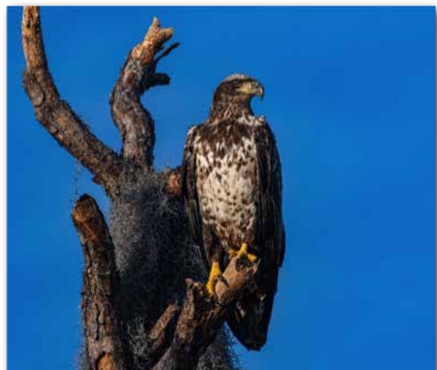
Even as an immature bird, the Bald Eagle is majestic in size and stature.