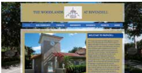
The Rivendell Community Web Site is available at

To find times and places, contact Sarasota County Library website: https://scgovlibrary.librarymarket.com/events/upcoming