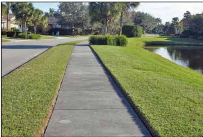
Placid Lake sidewalk before & after power washing

Residents that have sidewalks in front of their homes are responsible for their upkeep. If you're not sure if your sidewalk needs some TLC, check the common area sidewalks washed by Dutchman and see if yours compares favorably. Many thanks to the owners who have already cleaned their walkways. Your cooperation is greatly appreciated.