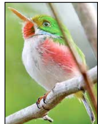
Left to right: Cuban Trogon, Cuban Bee Hummingbird, Cuban Tody