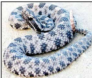
Dusky Pigmy Rattlesnake, Pigmy Rattler Usually small, averaging about a foot.