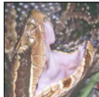
Florida Cottonmouth, Water Moccasin. Is aptly named. Notice the cottony interior.