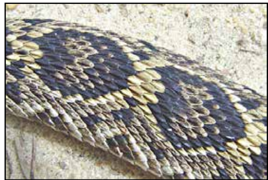
Eastern Diamondback Rattlesnake coiled and close-up of diamond pattern.

Eastern Coral Snake, Coral Snake When examining the colored bands of a banded snake, remember the saying, "red next to yellow with kill a fellow" to identify it as a Coral Snake. If red is not next to yellow it could be one of the harmless snakes that are often confused with the coral snake such as the Scarlet Kingsnake and the Florida Scarlet Snake.