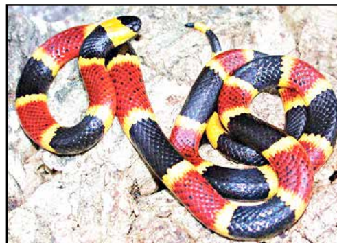
Photos of head and full body of the Eastern Coral Snake.