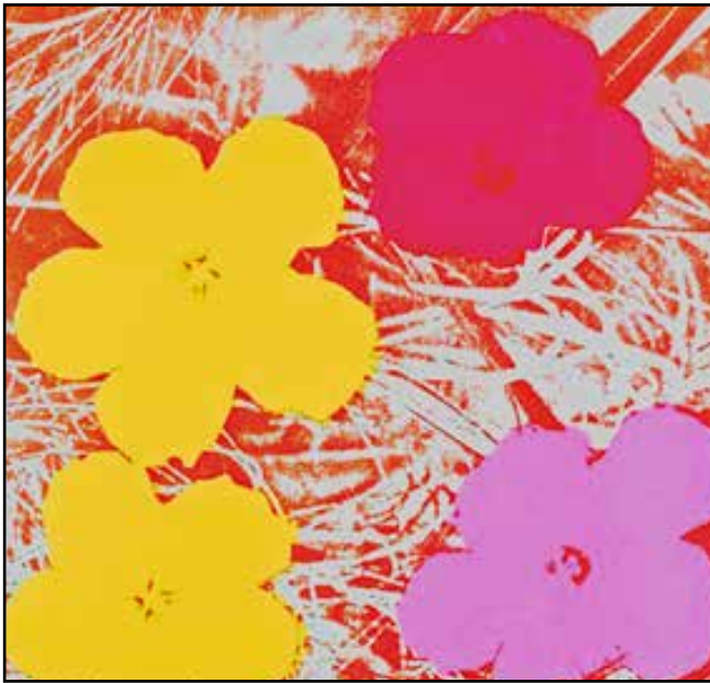
Flowers, c. 1967 Williams College Museum of Art

Excerpted: selby.org/events/event/warhol-flowers-factory