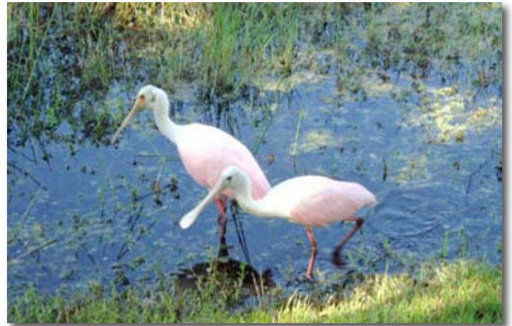
Roseate Spoonbills spotted in Rivendell Lake on September 8, 2012

Many thanks to all who sent in their garden photos for the 2012 Directory, and thank you in advance