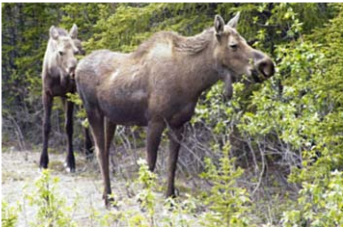
Another pair of Alaskan critters was a female moose and her calf.

Vic and I decided to take the land tour first, cruise second, and then tour Vancouver for a few days. Our first day in Alaska was to visit the pipeline; huge doesn’t describe it. Not all of it is above ground; some of the pipeline actually goes through the mountains. The following day took us up one of the rivers on a paddleboat. We tried sitting in the front of the boat but it was so cold we took cover inside the cabin. We also visited a gold mine and, yes, we panned for gold. We traveled to Denali National Park on our third day, where we saw a momma grizzly and her cub.