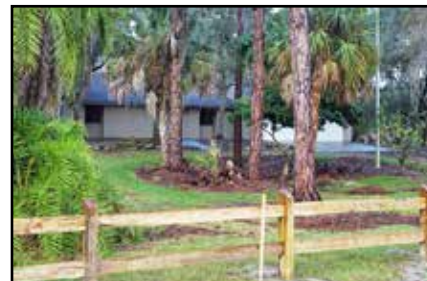
Bay Street Extension with vinyl fence and possible visitor center & rail fencing