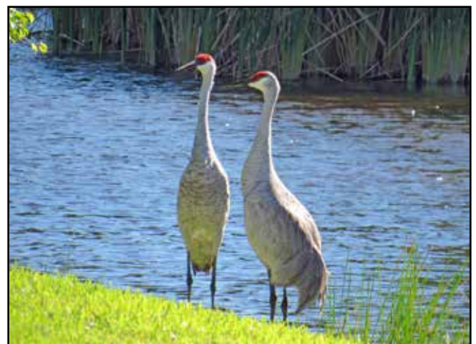
Sandhill Cranes at Millpond Lake