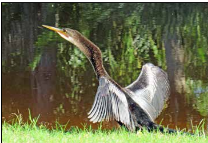
Anhinga in Rivendell