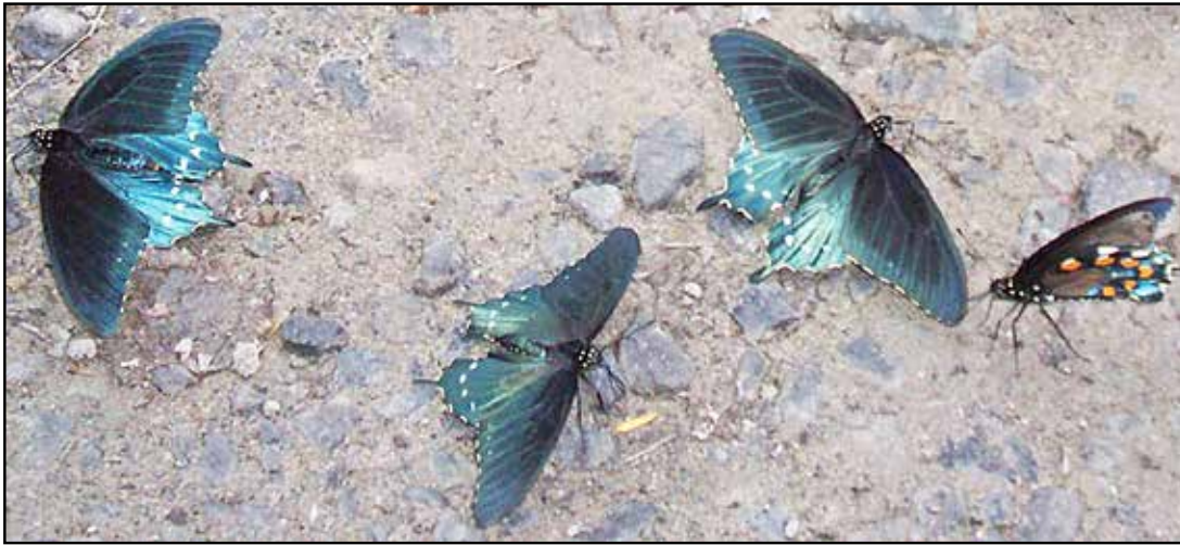
Black Swallowtails puddling