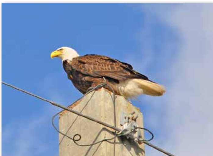
An eagle on the cement electrical pole was just outside of Pine View School.

Next Rivendell Board Meeting October 5th 6pm At Clubhouse in The Cottages