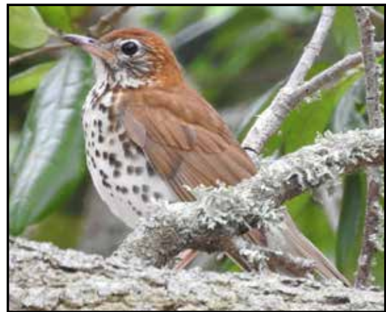
Wood Thrush-Dennis Main