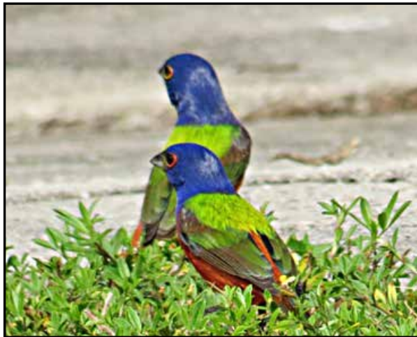
Painted Buntings-Lenee Owens