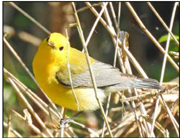
Prothonotary Warbler-Dennis Main