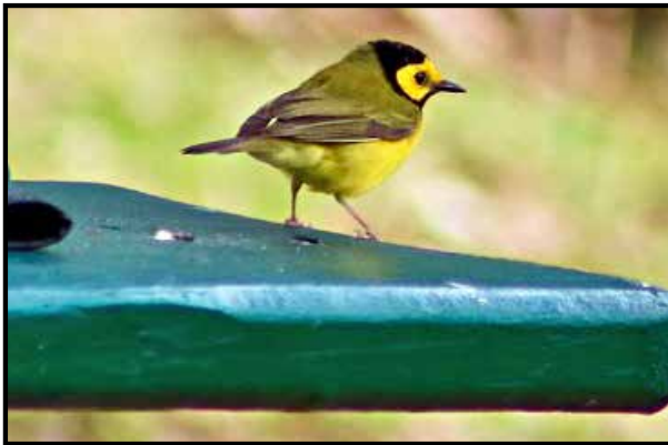
Hooded Warbler-Louis Sharp

Be sure to view the COLOR photos in the Woodlands Word on the website: www.rivendellcommunity.com