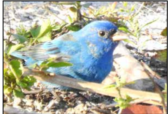
Indigo Bunting-Dennis Main